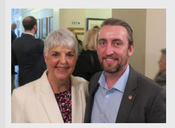
BC NDP budget removes interest on provincial student loans, invests in health care, poverty reduction and transit.