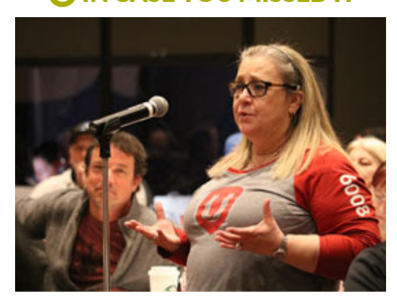
Members discuss outsourcing, technological change and political action at telecommunications conference.