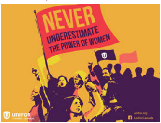
Here is a list of International Women's Day marches happening across Canada. Join in at the one nearest to you.