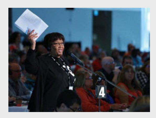
As Black History Month wraps up, we reflect on challenges members face and celebrate their activism and resistance.